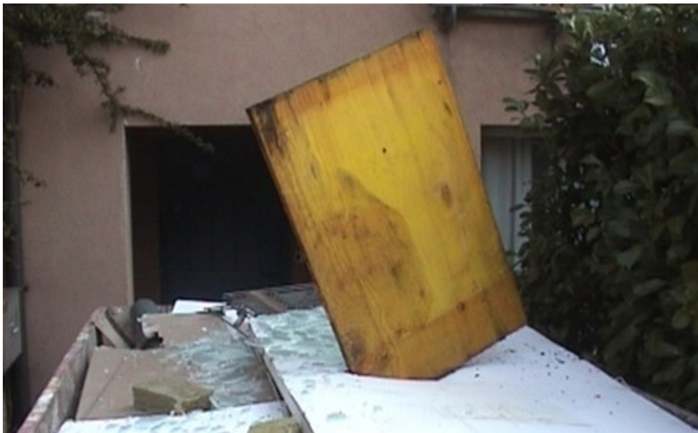
Movie Sieben Mulden und eine Leiche