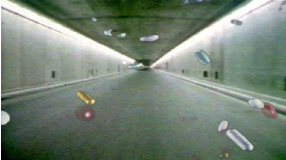
Experimental Video Der Gotthard Tunnel ist Schwarz

Zentralstrasse 18, 8003 Zurich Switzerland Tel. +41 43 542 6283 Mobile + 41 76 577 0854 info@mondejargallery.com www.mondejargallery.com Gallery Hours: Tues-Fri 16-19, Sat 14-18 Uhr or by appointment