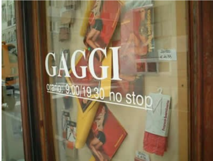
Solo Exhibition GaggiNoStop