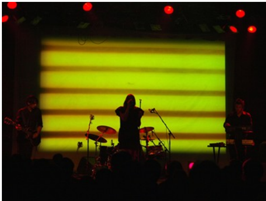
Concert Visuals Division Kent